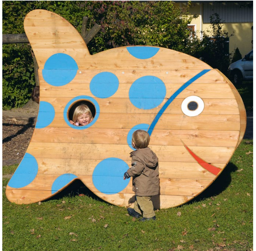
Small Fish with Peepholes, Floor and Bench